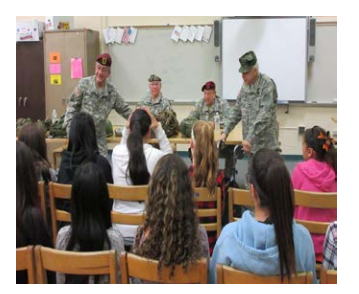
Veterans Visit CHPS

P.S. Be sure to follow us on <u>Twitter</u>, <u>Facebook</u> and <u>Instagram</u> for the very latest happenings around the District. Our <u>District Events Calendar</u> on the District web site is a great resource for updates about upcoming events. <u>You'll find the 2015-2016</u> <u>School Year "Overview" Calendar here</u>. For events and activities in the Cherry Hill Community, check out our <u>Community Bulletin Board</u> on our <u>web site</u>. And visit our <u>YouTube channel</u> for videos from around the District.