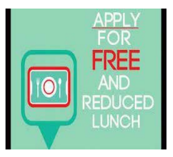
Free and Reduced Price Lunch Applications Now Open

When you stop by the Cherry Hill Public Library (CHPL) this month and sign up for a card, you'll be eligible to win a variety of prizes including gift cards to Ponzio's, Michelangelo's, and Amazon. Also on the