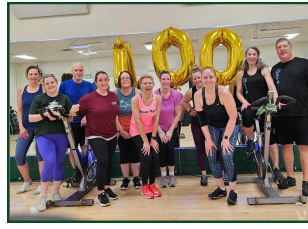
Group Fitness Classes