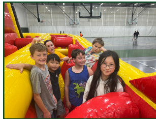
Bounce House Fun