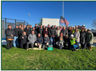
Topping off ceremony