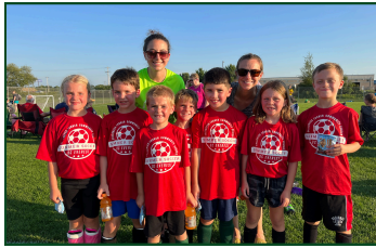
REC Outdoor Soccer