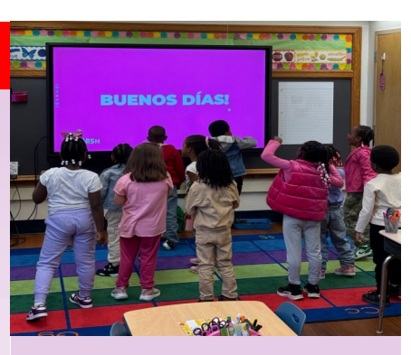
It's National Hispanic Heritage Month!