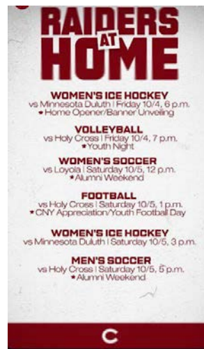
Information Credit: Colgate Athletics Website

Overall, the Raiders did well this week, taking on several tough opponents. They look to continue their dominance on both the field and on the court this upcoming week.