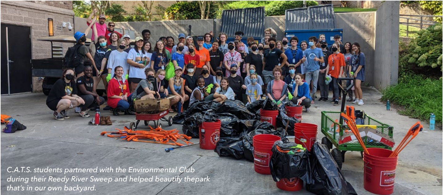
C.A.T.S. students partnered with the Environmental Club during their Reedy River Sweep and helped beautify the park that's in our own backyard.

Here at the Governor's School, we are excited to have the service learning program Connecting Arts Through Service (C.A.T.S.) acting as the student arm of our Outreach Programs. C.A.T.S. is designed to help students explore their service interests and teaches them to investigate, plan, and carry out projects in their local communities. C.A.T.S. also helps match students with opportunities to volunteer with partner organizations encouraging them to reflect on and learn from their service experiences.