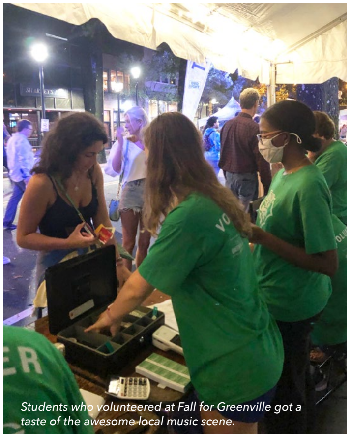
Students who volunteered at Fall for Greenville got a taste of the awesome local music scene.

Despite the lingering challenges we've faced with the COVID-19 pandemic, C.A.T.S. students have been eager to get involved and given a lot of time to the Greenville Community. Take a look at some of their work!