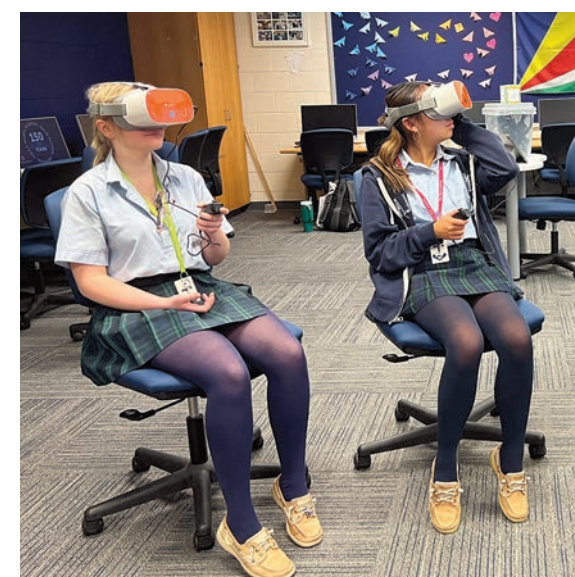
Students explore models of a cell using CLASSVR headsets.