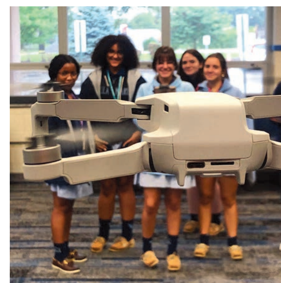
The Technology Club models search and rescue techniques using drones.