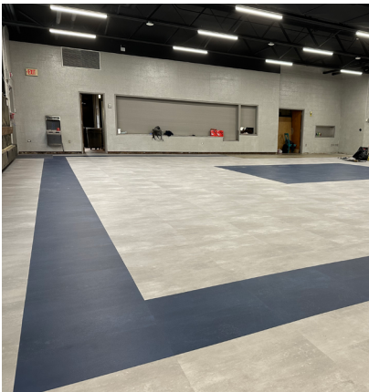
(Pictured Below) Denton Ave Elementary School & Center Street Elementary School