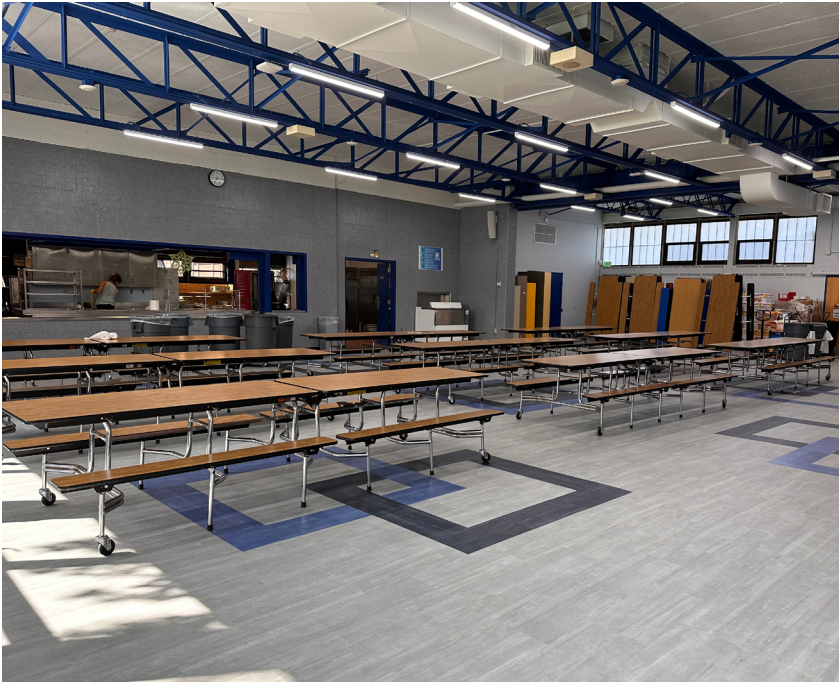
(Pictured Above) Searingtown Elementary School

Each of our elementary school lunchrooms have received a makeover for the new school year.