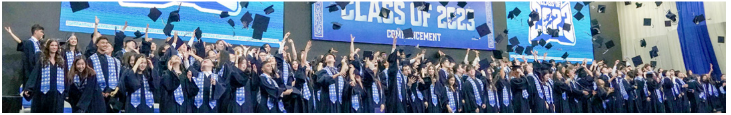
CLASS OF 2023 GRADUATION