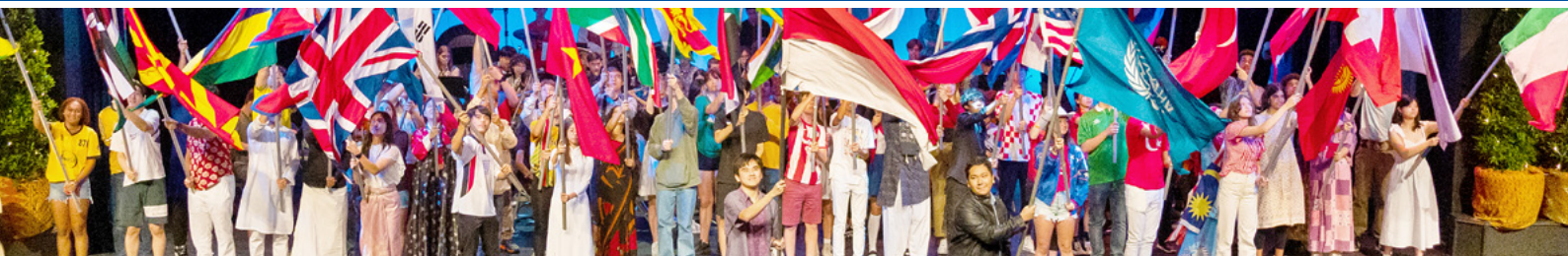
UNITED NATIONS DAY

For 72 years, Jakarta Intercultural School (JIS) has prepared students from across the globe to be best in what they aspire to and at the same time, be best for the world they live in.