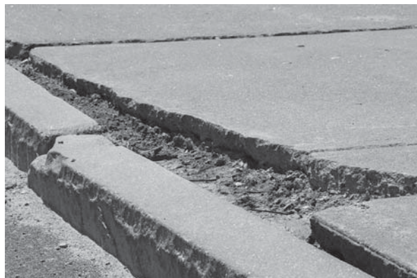
Front Jr./Sr. high sidewalk

The Board of Education and Administration are currently planning a Capital Project (different from a Capital Outlay Project) to address larger projects that are critical to improving and sustaining the student learning environment, such as roofs, infrastructure, and site-work improvements and repairs. Thanks to conscientious stewardship of District funds and taxpayer's dollars, an upcoming Capital Improvement Project will have no additional impact on the tax levy.