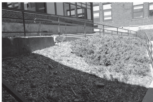
Interior courtyard drainage issues