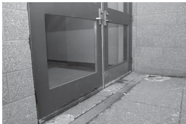
Exterior courtyard doors/sidewalk