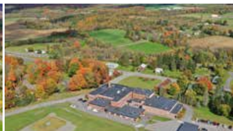
Images of our elementary and high school buildings as taken by a school drone.