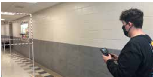
High school students completing drone obstacle courses as part of their coursework.