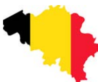
GET TO KNOW THE FOREIGN EXCHANGE STUDENT Page 6