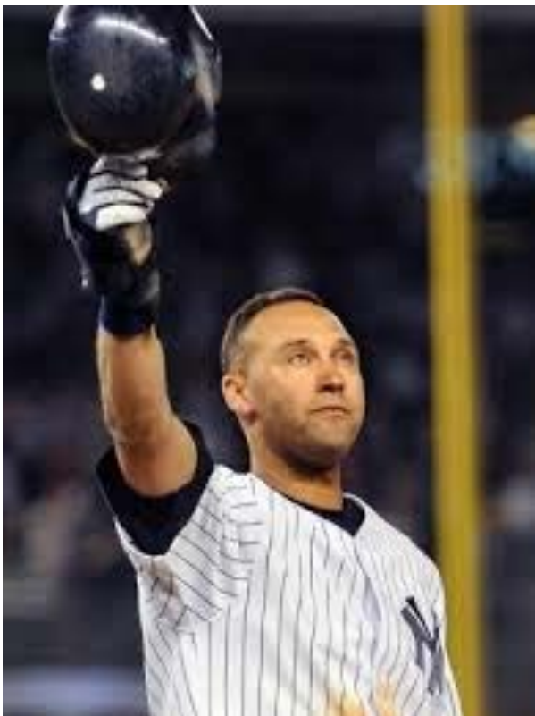
Derek Jeter