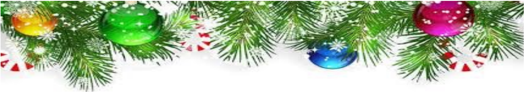
Locker Decorating by the Class of 2018