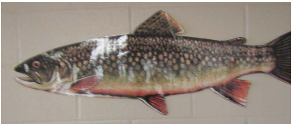
Fully grown trout