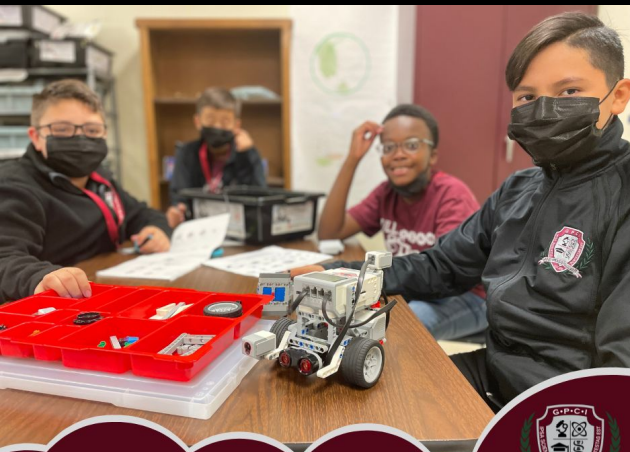
Big Dreams Happen Here