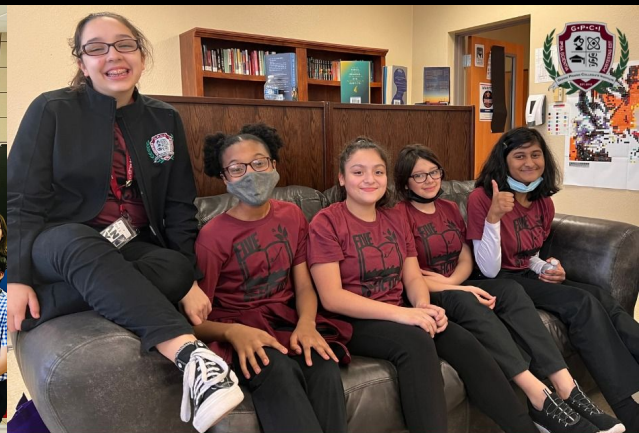
Battle of the Books Champions