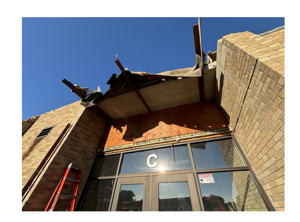
CONTINUED DEMO FOR EAST ADDITION