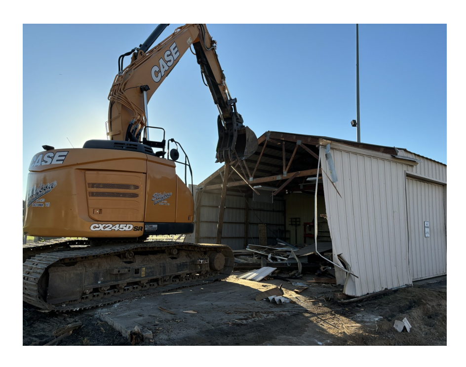
DEMO OF MAINTENANCE SHED