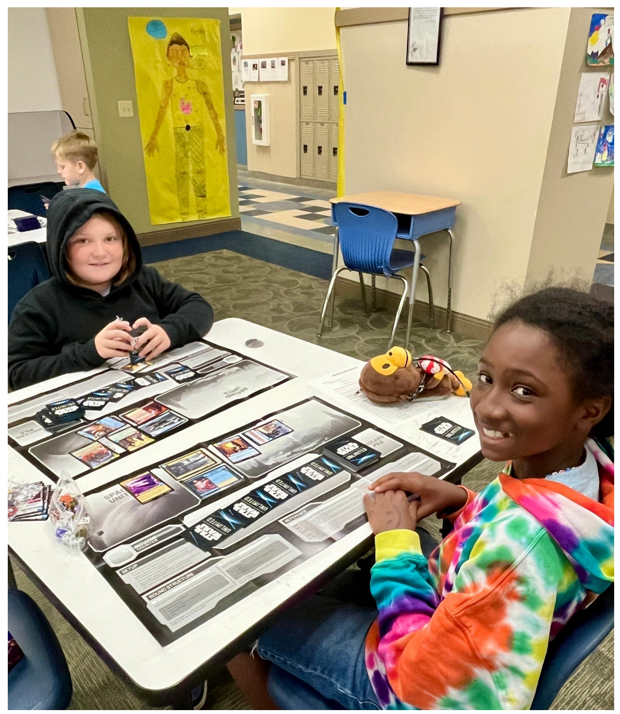
The Trading Card Game (TCG) Club met after school this past week.

Click here for more Events and Information from around WCS & the community, including: