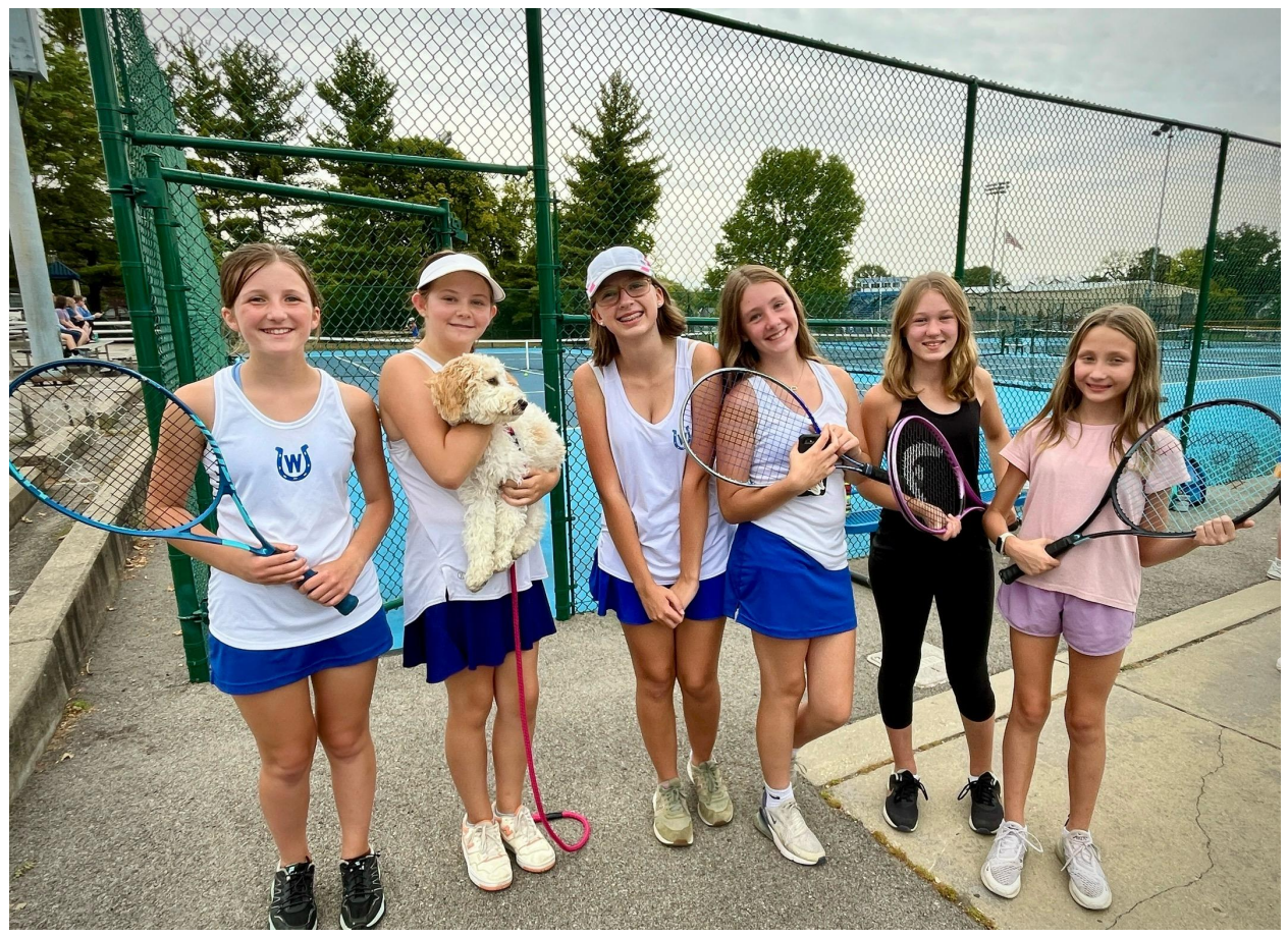
Congrats to our Tennis Teams on their success against Madeira on Monday evening!