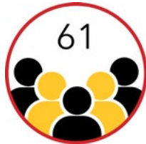
Students Senior Class