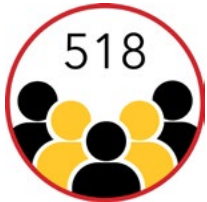
Students 7 th to 12 th grades