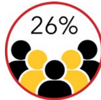
Students Receive Financial Aid