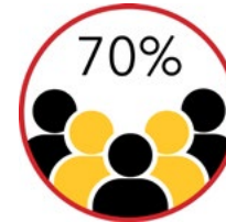
Faculty members holding a master's or a doctoral degree