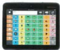
Tobii- Dynavox I-110