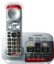
Panasonic KX-TGM 450