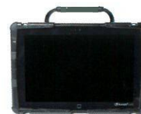
Prentke Romich Company Accent 1000