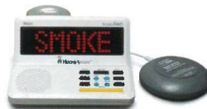
Home Aware Kit