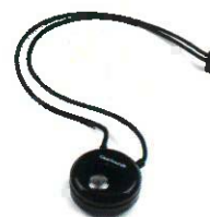
ClearSounds Quattro Pro