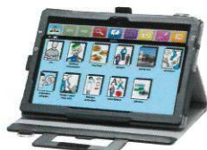
Lingraphica Touch Talk