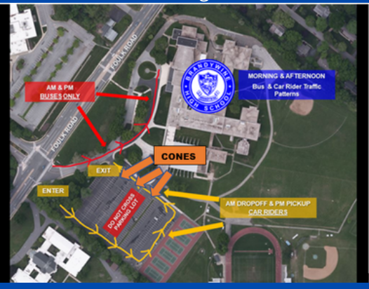
Please review the diagram below.

Please remember that we have cones up in the parking lot to prevent people from driving down the rows other than the last row near the tennis courts. This is to keep our young drivers safe, as this is to keep our young drivers sale, as this is where they are expected to park. All traffic for dropping off and picking up should follow the path down to the tennis courts and then up around to the exit. This is for both morning and afternoon. We appreciate your support with this!