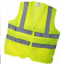
Watch D.O.G.S. Vests Provided for the day