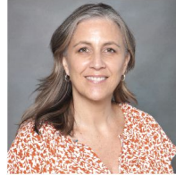
Ms. Purse History