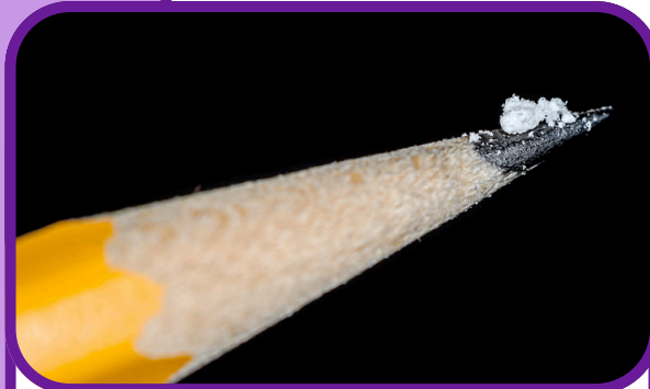
A lethal dose of fentanyl

Overdose can cause stupor, changes in pupil size, clammy skin, cyanosis, coma, and respiratory failure leading to death. The presence of a triad of symptoms such as coma, pinpoint pupils, and respiratory depression strongly suggests opioid intoxication.