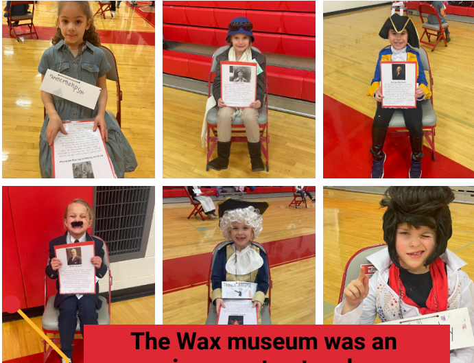
The Wax museum was an amazing event put on by our 1st grade staff and students.