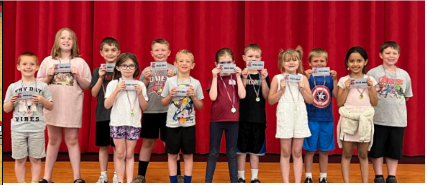
Congratulations to our Comet Leaders from the fourth quarter! They displayed determination and grit throughout the school year.