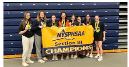
NY Mills Class D Girls Champions