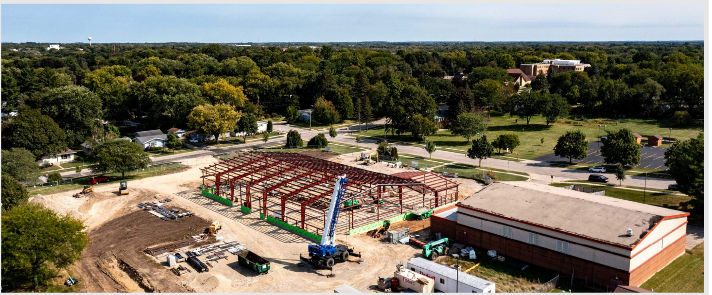
Above: a view of the overall progress at the Yahara Site captured during the last Findorff drone flight 9/10