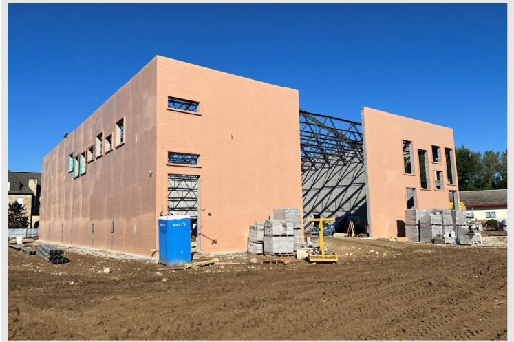
Above: a photo of the River Bluff addition gym box following the air & vapor barrier application

You may have noticed the exterior of the Yahara Gym has begun to look a little different. That is because painting of the exterior metal soffits, metal flashings, and door frames is underway. This new color will match the exterior metal wall panels of the new Maintenance Building.