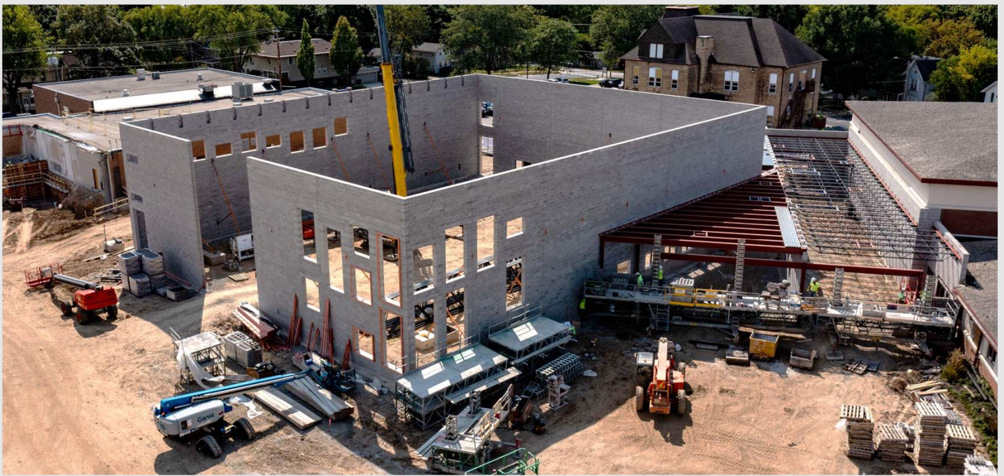
Above: a photo of the overall progress of the River Bluff addition captured during the last Findorff drone flight 9/10