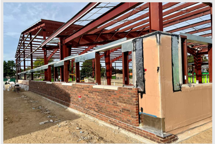
Above: a view of the progress at the Maintenance Building as installation of the brick masonry goes into place