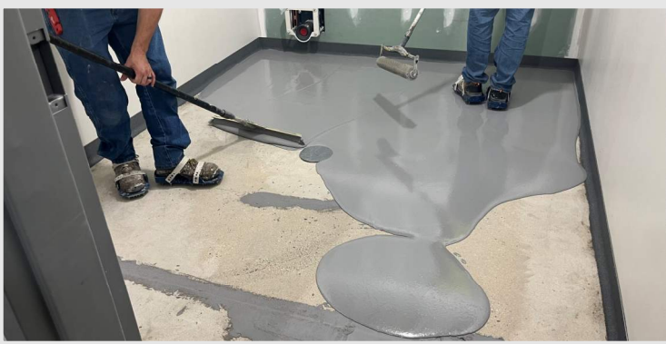
Top Left: photo as the first coat of epoxy flooring is installed

Looking ahead – the Commons is set to receive dryfall paint to the underside of the exposed metal deck, structural steel, and MEPs after MEP rough-ins are 100% complete. Installation of the ceramic tile is also ready to kick off in the Commons and Served spaces. After the painting of the Commons is complete, we look forward to more exciting finishes such as casework, wood wall panels, acoustical baffles, overhead coiling doors, and MEP fixtures to begin.