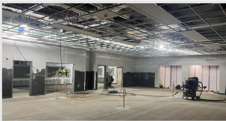
Bottom Left: a view of the Served space following floor prep and tile base install