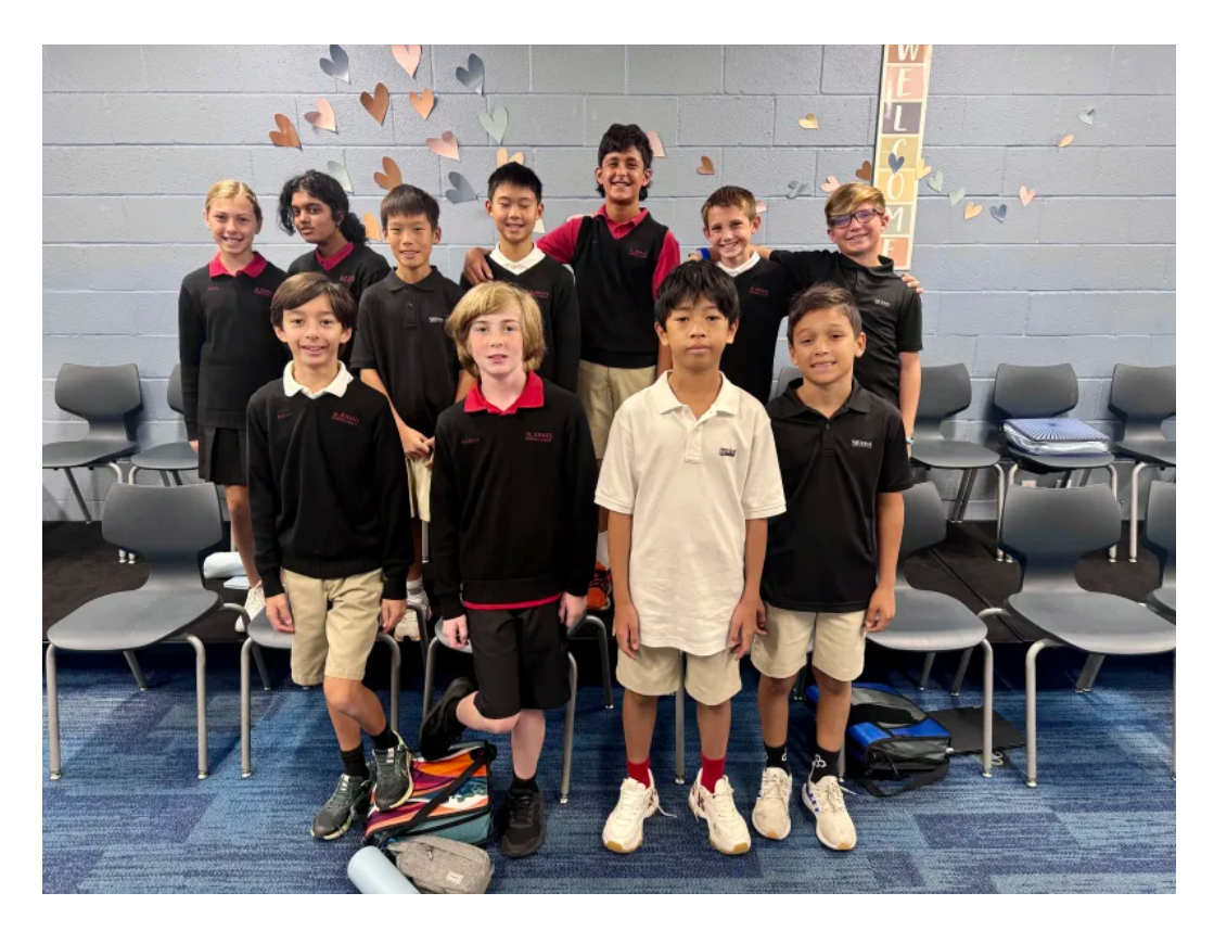
Middle Division Students Make Music