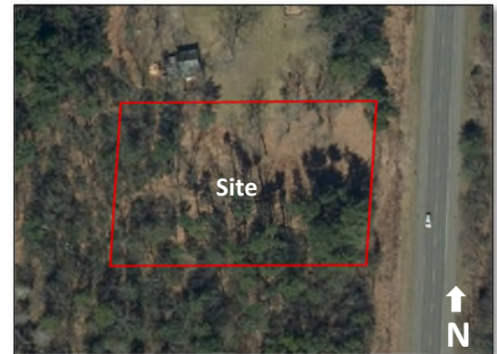
Figure 1: Approximate Site limits.

In accordance with our contract, GZA conducted a wetland assessment and delineation on June 18, 2024, within an approximately 1.3-acre parcel ( Figure 1 ) that is located at 354 College Highway, Southampton, Massachusetts ("Site"). The intention of the assessment was to determine if regulated wetland resources are present on the Site. GZA returned to the Site on July 26, 2024, to collect a paired wetland data form for the isolated wetland present onsite. This letter report provides an overview of our assessment methodology and findings.