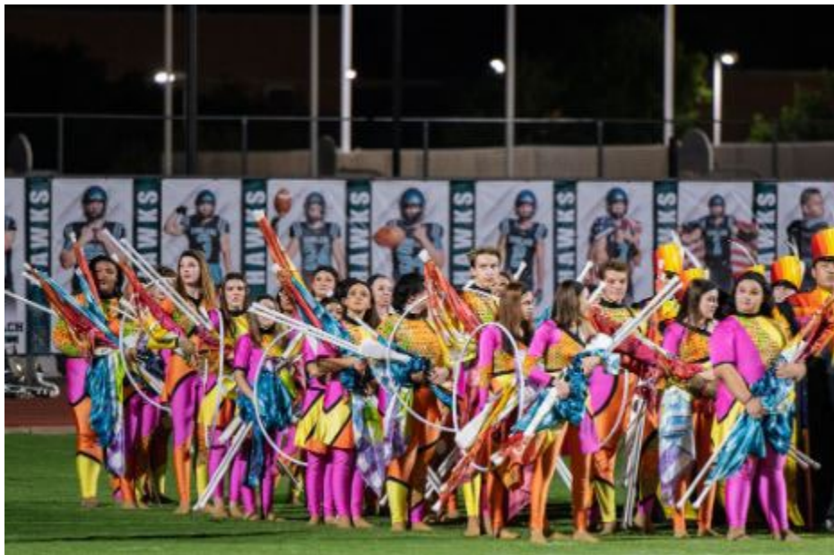
KYRENE YOUTH COLOR GUARD