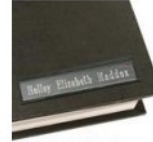
One Line Name Plate