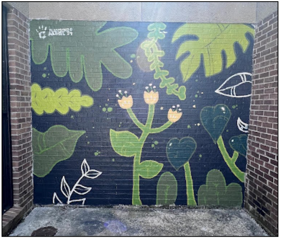
The STA secret Garden Mural finished project, located in the space where 7 Brew is sold on Tuesdays.