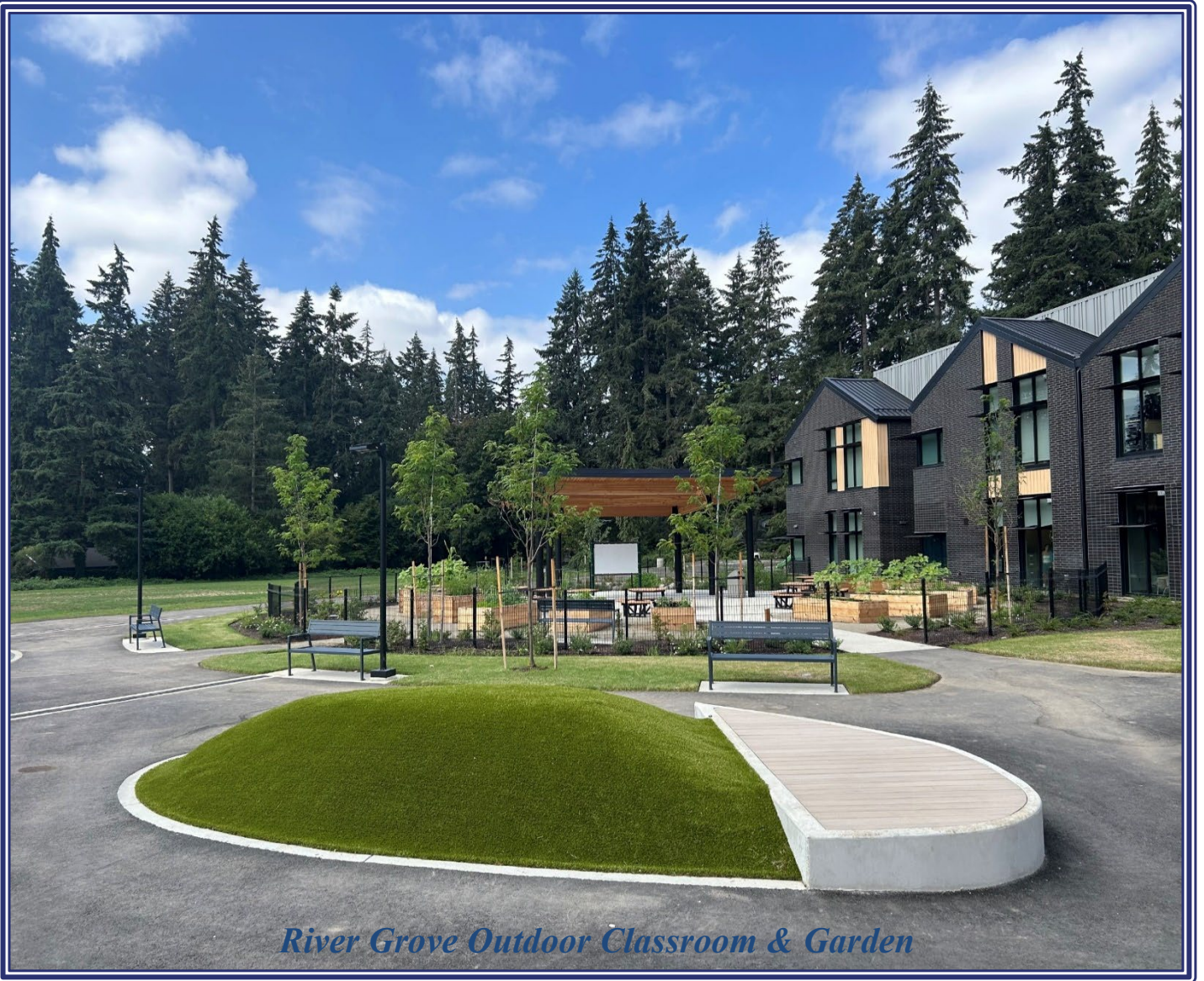
River Grove Outdoor Classroom & Garden