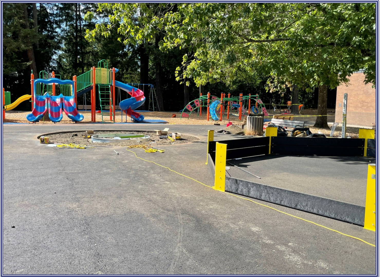
Westridge Elementary Playground Upgrades

Palisades Elementary Renovations Playground & Garden Upgrades Elementary Schools HVAC Retrofit