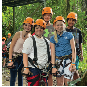
Costa Rica, 2022