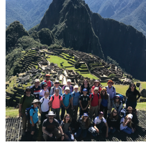
Machu Picchu, 2018