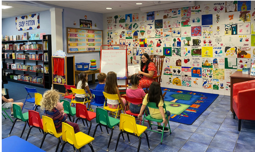
MSD students attend summer reading program at the Milford Public Library

We believe in ensuring that each student has equitable access to the appropriate resources and supports to thrive.