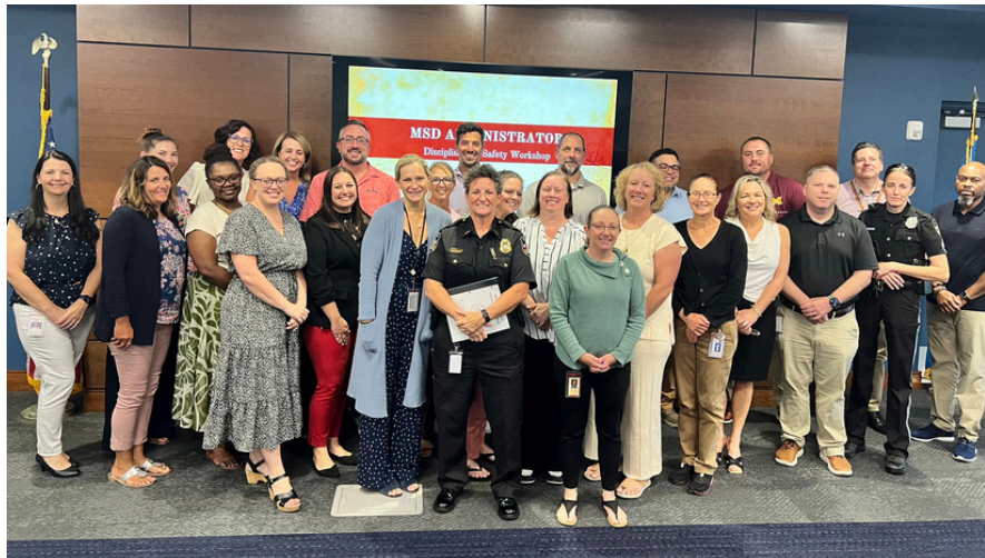
Milford Administrative Team and the Milford Police Department

We believe the district's partnerships with families and community are integral to the success of our students and community at large.