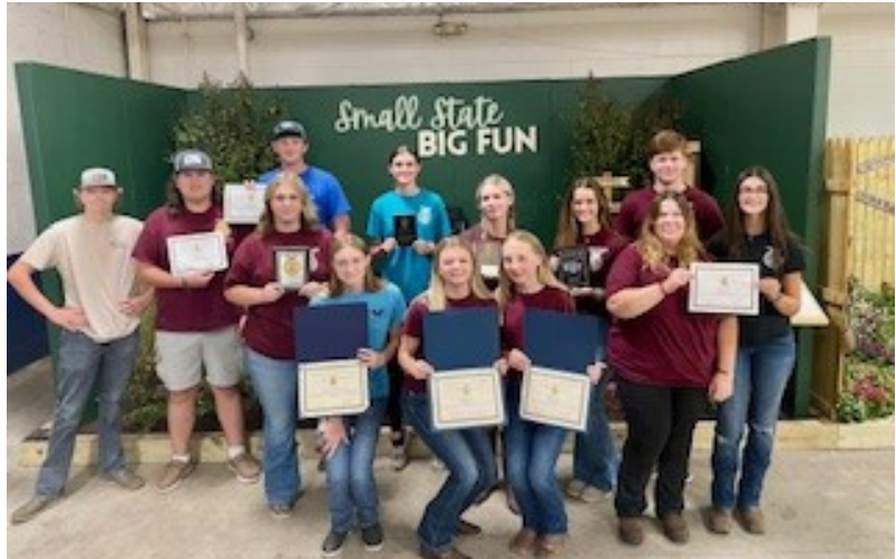
MHS and MCA representing Milford well at the Delaware State Fair

We believe the arts, extra-curricular, and co-curricular activities are integral components of a well-rounded education, fostering much personal growth.