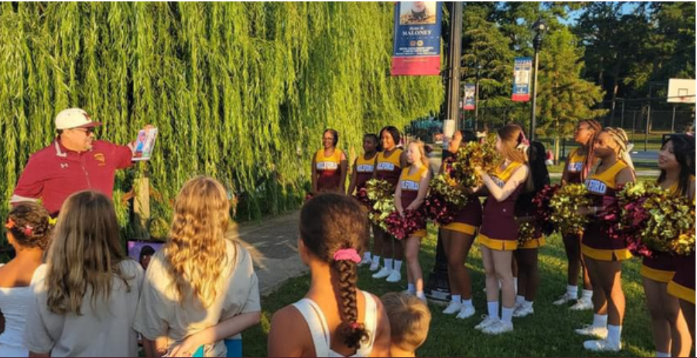
Several MSD Staff and Cheer Squad read aloud for the Riverwalk Storywalk ribbon cutting

We believe the foundation of excellence is rooted in an academically rigorous curriculum, supportive instruction, and high expectations for each learner