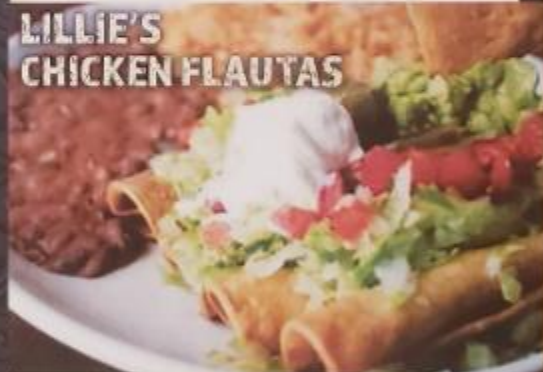
LILLIE'S CHICKEN FLAUTAS