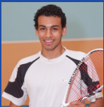
Mohamed El Shorbagy

Double World Junior Champion, former World number one and current number three.