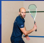
Marwan El Shorbagy

Double World Junior Champion, current number seven.