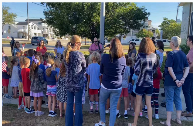
LBI and EJ Grade Schools staff and students gathered at their schools to honor, sing, and pay tribute on Patriot Day.