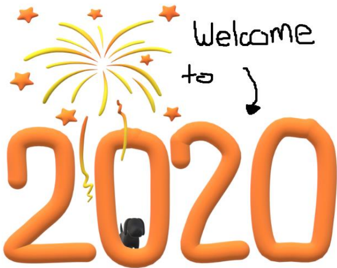
Original Illustration by Grace Micali