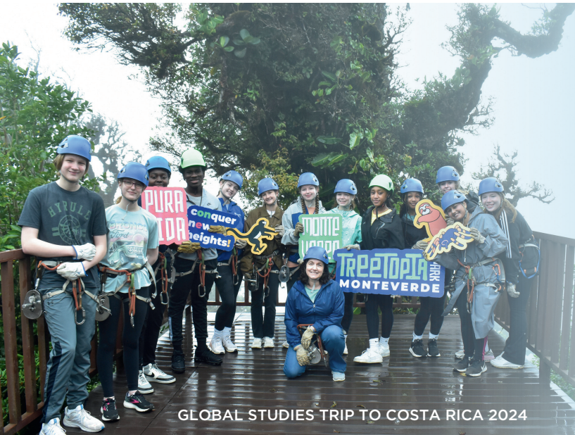
GLOBAL STUDIES TRIP TO COSTA RICA 2024