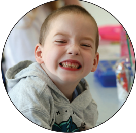
PHOTO RELEASE, PRIVACY INFO.

The Phelps-Clifton Springs Central School District celebrates the learning and accomplishments of students in materials that may include, but are not limited to, honors/awards, non-graded work, photographs, videos, and voice recordings.