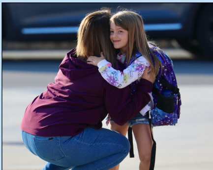
Students are back! View a photo gallery of the first day of school.