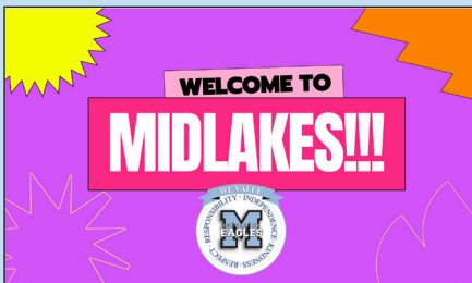
Meet some of the newest members of the Phelps-Clifton Springs Central School District in a welcome video.