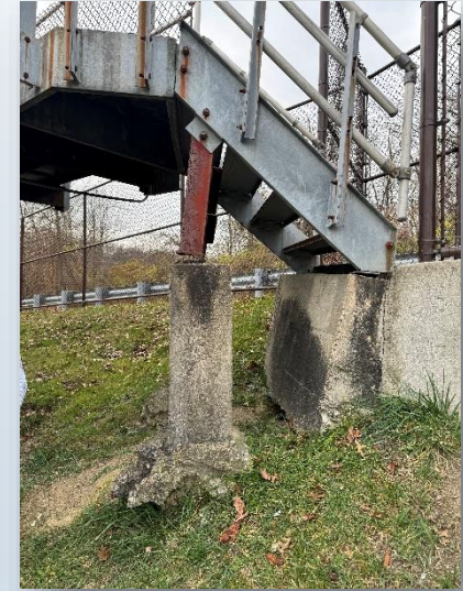
Exposed Bleacher Foundations at North End