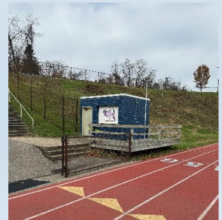
Existing Concession Stand