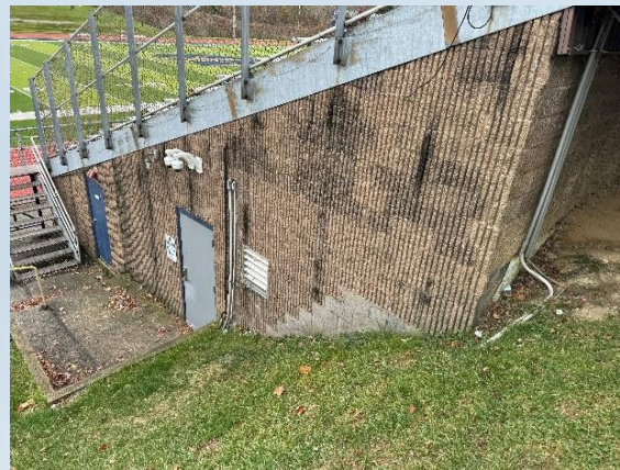
Deteriorating Face of Masonry Walls