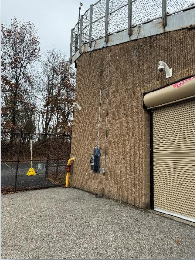
Perimeter Guardrail Fence needs replaced