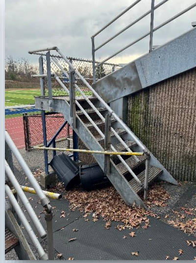
Bleacher Stair access not code compliant