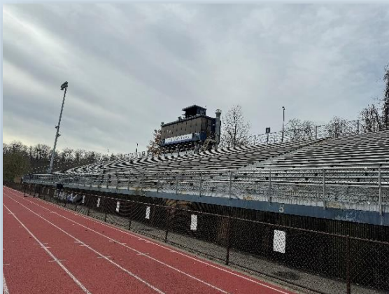
Existing Bleacher Structure