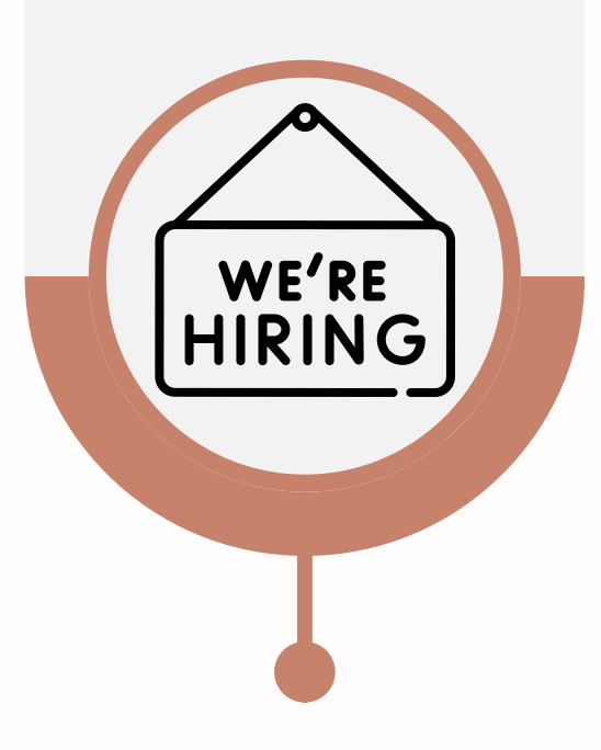
September 12 - 27