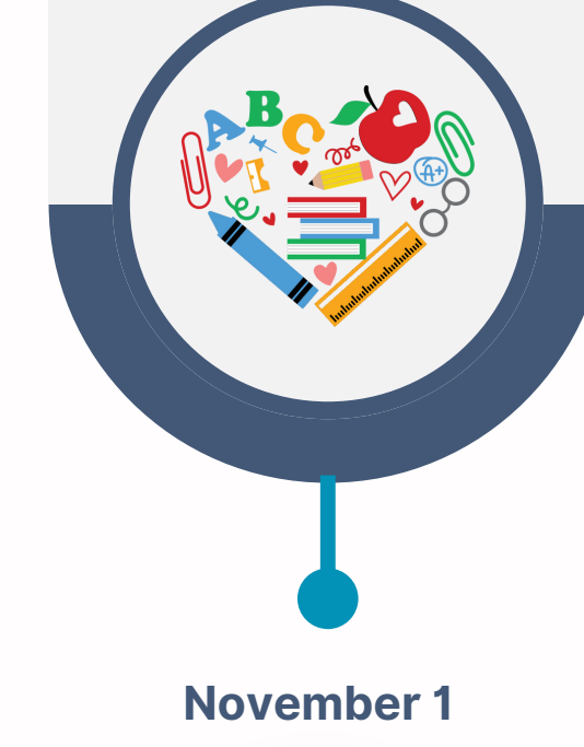
First Full Day

1/2 the class attends school M/W all day. 1/2 the class attend T/Th all day.