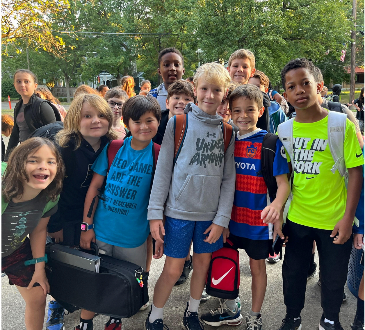
5th Grade Students ready to start the day!