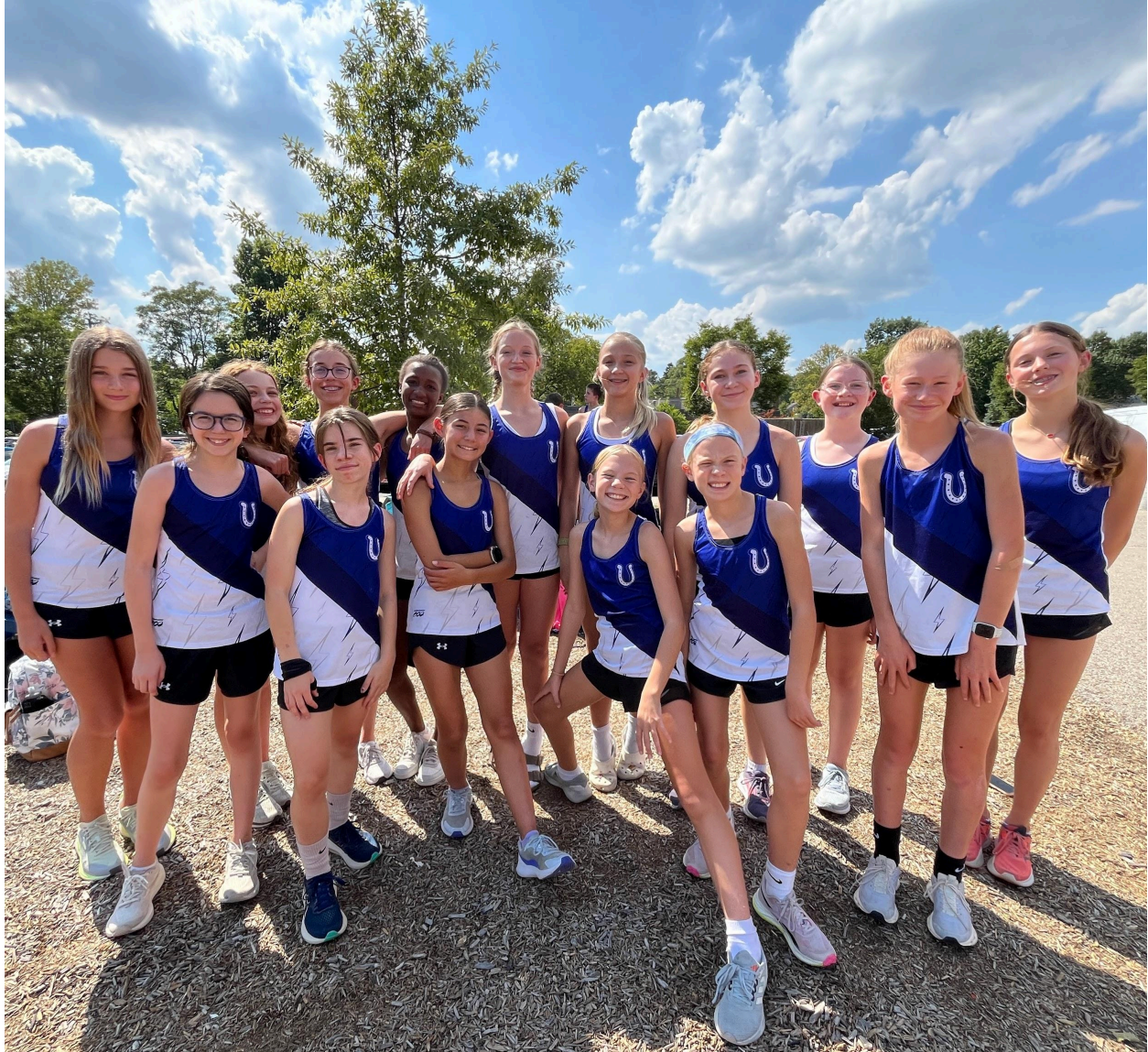
Our Club "Round Up" took place on Friday, September 6 at lunch. Below are photos from the sign up stations for Yearbook Club along with several of the other clubs available to students!