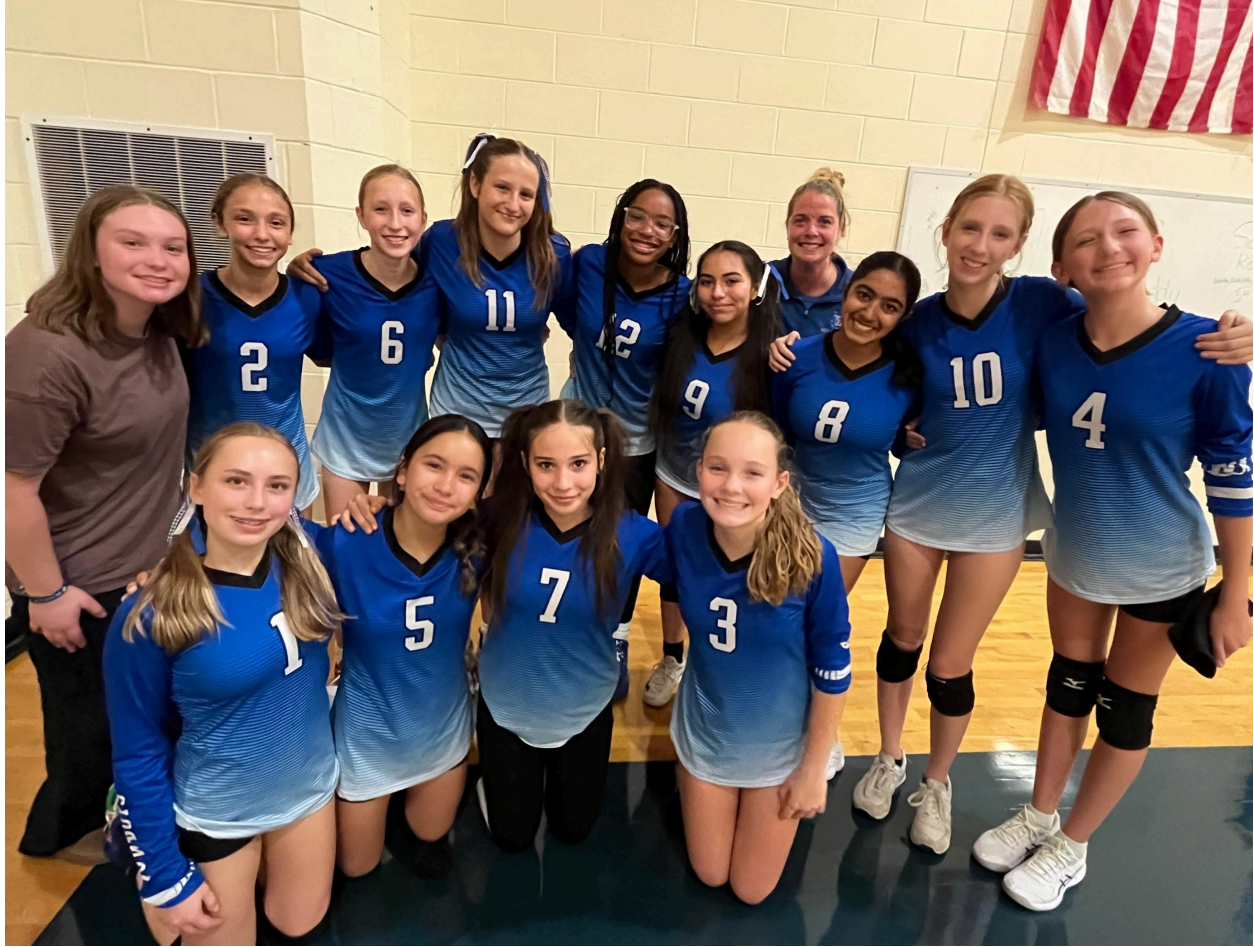
Volleyball Teams posted big wins over Reading on Wednesday evening. 8th Grade pictured above, 7th Grade below. Great job ladies!