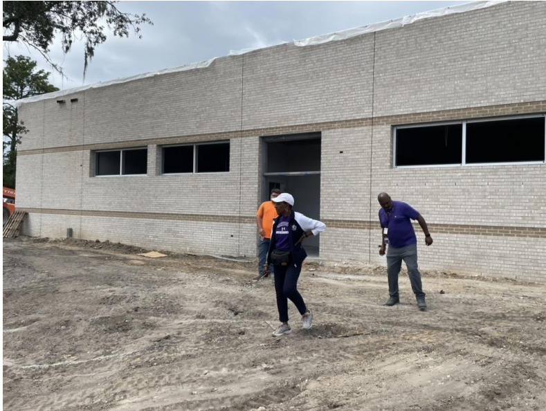
Site inspection - HHIHS New Field House