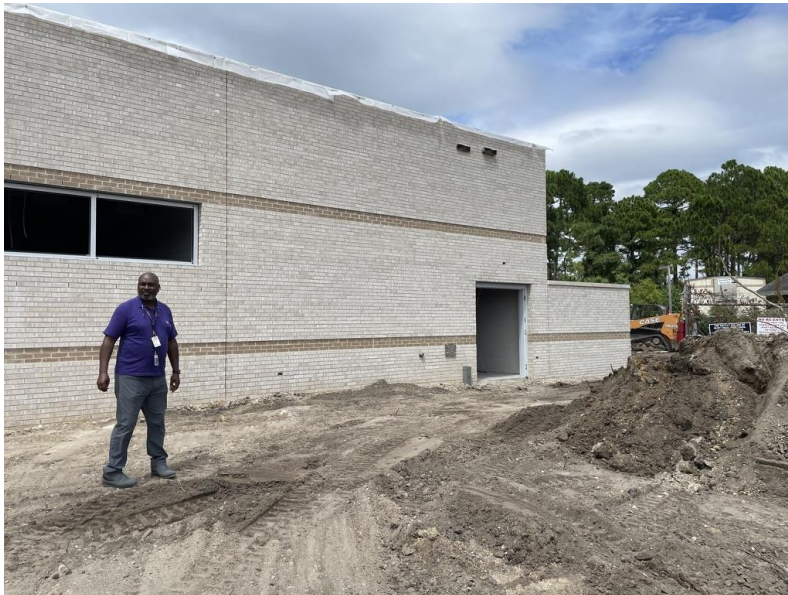
The graded area will be a paver "Mall" area when completed. The area abuts the old field house and baseball field.