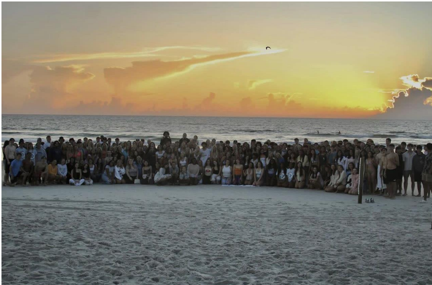
Class of 2025 gathered at the beach together for the annual senior sunrise.

Monday, September 9, 2024 – Volume 1, Issue 1 – Port Orange, FL - https://www.sprucecreekhigh.com/