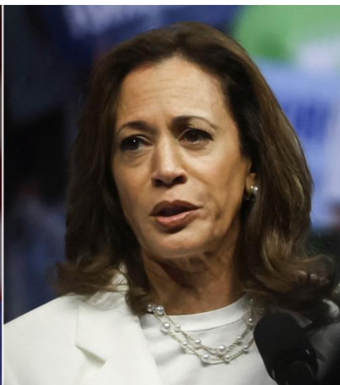
Former President Donald Trump and Vice President Kamala Harris