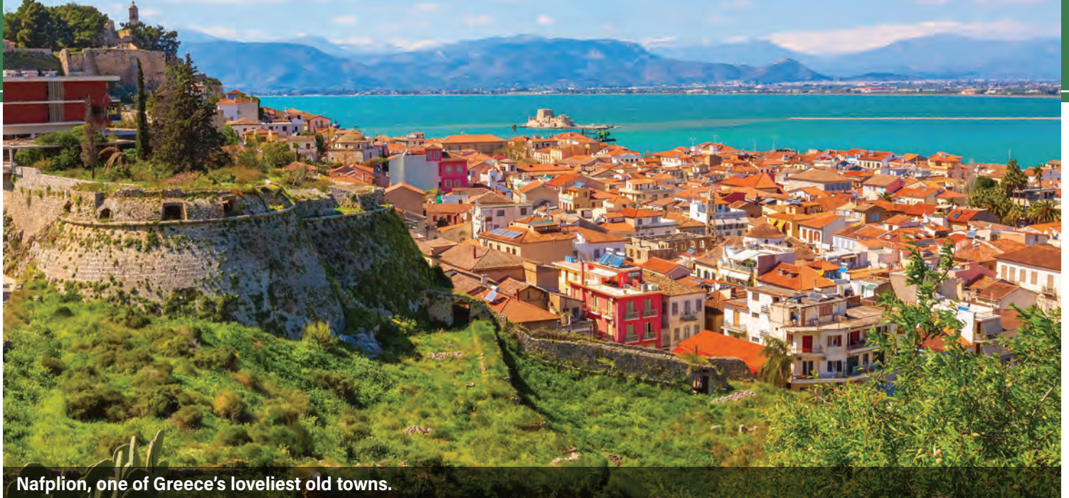
Nafplion, one of Greece's loveliest old towns.