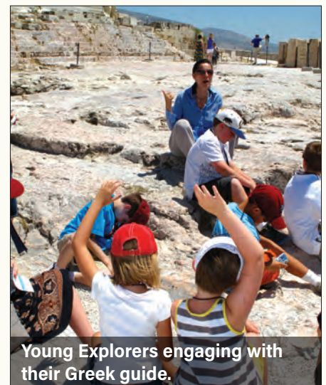
Young Explorers engaging with their Greek guide.