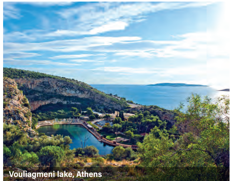
Vouliagmeni lake, Athens

The largest of the Greek islands, Crete is home to Europe's first civilization, the Minoan, which rose about 4,000 years ago. With an incredibly beautiful and varied landscape that harbors over 2,000 plant species, outstanding archaeological sites and museums, historic old towns, and a cuisine that gave birth to the Mediterranean Diet, Crete is a magnificent place to visit. Many of the ancient Greek myths took place here, and Zeus, the supreme ancient Greek god, was reared at one of the island's caves. We will drive in the morning to the south of the island to visit the Minoan palace of Phaestos (2nd millennium BC), which is located in a beautiful plain. Continue to the superb Preveli Beach, where swimming can be enjoyed, and after lunch at a local restaurant, drive to Rethymno, one of Crete's most attractive towns, known for its well-preserved architecture dating from the Venetian and Ottoman periods. Return to the hotel late in the afternoon. (B, L)