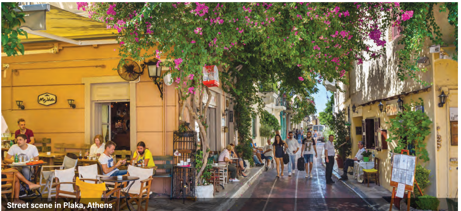
Street scene in Plaka, Athens

After a morning at leisure in Athens, drive along the scenic coastal road of the Athenian Riviera to Vouliagmeni, a fashionable seaside resort, famed for its lake of warm water enclosed by limestone rocks. Those who wish may enjoy swimming in the inviting brackish sulphureous waters. After lunch at a lakeside restaurant we will drive