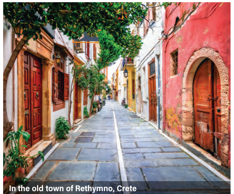
In the old town of Rethymno, Crete

Spend the morning at leisure for independent activities. Crete has been known for its curative herbs since antiquity. You may wish to visit Heraklion's herb market, where shops sell a wide variety of the island's herbs. In the afternoon, tour the palace of Knossos, the largest and most magnificent Minoan palace in Crete. Clustered around a spacious courtyard, the palace contains a maze of rooms, passages and stairways that probably generated the concept of the labyrinth. More than any other palace, Knossos reveals the brilliance and refinement of the Minoan civilization. Also visit the superlative Archaeological Museum, home to the world's finest Minoan artifacts. Young Explorers will tour Knossos with a specially-trained children's guide. Farewell dinner will be served at a local restaurant that specializes in Cretan cuisine. (B, D)