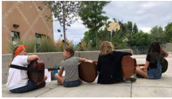
Above: Guitar Lab students join an afternoon jam.

instead of just two. Adding block time to weekly instruction was implemented to enhance learning opportunities and augment elective options during the day. The new schedule provides more freedom for juniors and seniors who may select to take either the first or eighth period off, according to their individualized needs. This means that we've eliminated Access as a set class each week, and will build in relevant class meetings, assemblies, college lessons, and assessment preparation into our weekly schedule and subject offerings. All of these efforts are to keep students at the center; more block days mean more problem-based approaches, fewer courses for nightly homework, more feedback for each student, and new avenues for collaboration and innovative learning. The doors are now wide open, and opportunities for every student to pursue their interests and passions. The change in the block schedule provided openings for new coursework, particularly at the middle school level where a number of elective courses have been added. We are excited to add guitar classes, more diverse art, theater and physical education courses, innovative technology classes, storytelling, and independent study courses.