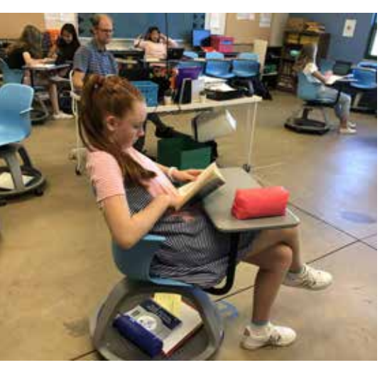
Above: The so-called "node chairs" are a popular addition to the middle school World History classroom.

If you haven't been to our campus in a while, you might not recognize it as the same school you attended. Not only are there physical changes, but we continue to make programmatic adjustments and improvements. This year, we have implemented a new secondary schedule for the 18-19 school year. There is now an additional class period taking us to eight class periods, and four block days a week