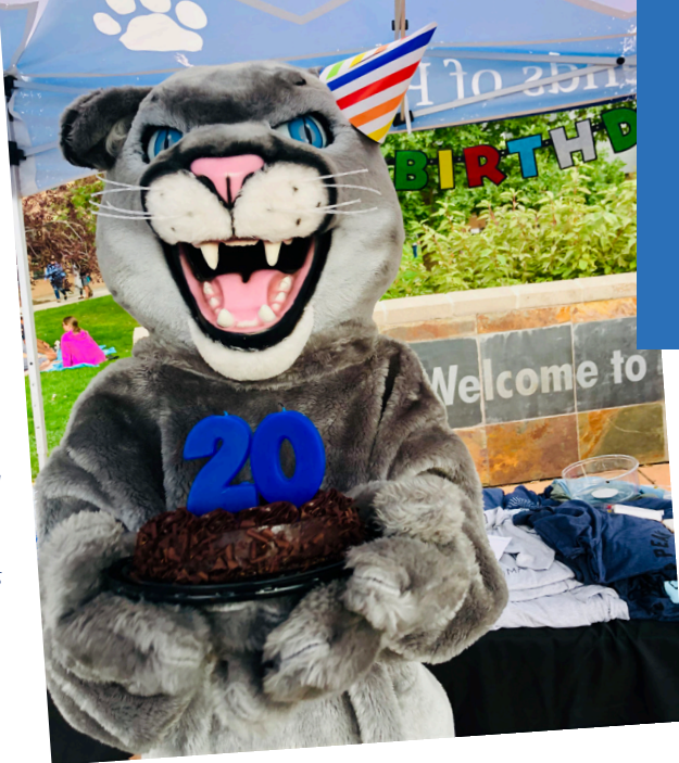
On the cover: The Peak to Peak Puma has a new look but the same school spirit!