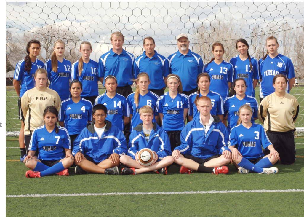
The 2013 State Champion Girls High School Soccer Team