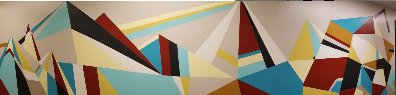
Below: A new mural painted by middle school artists adorns the second floor hallway in the LMC outside of the fifth grade classrooms.