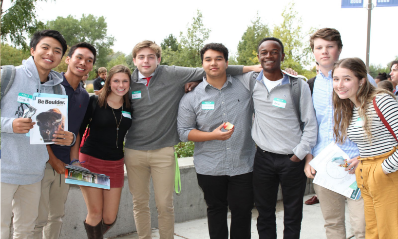
In early October the College Counseling Center hosted the 10th annual Peak to Peak College Day! Over the past 10 years, there have been more than 1,170 individual presentations on college day. From 2005 to 2019, the counseling staff has submitted materials for more than 10,050 college applications. On average, 5.4 college applications were submitted for every alumni during their senior year of high school. Since the school started keeping track, there have been approximately 2,660 college visits to Peak to Peak.