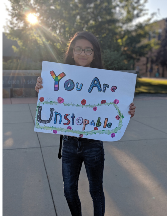
Right: Fifth graders raising spirits and welcoming students, staff, and families to school one early September morning.