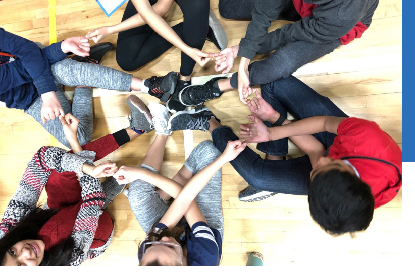
Above: Seventh-grade students join in teambuilding activities during their annual Courage Retreat, a tradition added in 2016.

On the cover: Peak to Peak's Ethics Bowl team reached the finals in the regional High School Ethics Bowl for the 4th consecutive year, placing 2nd and 3rd in the overall competition.