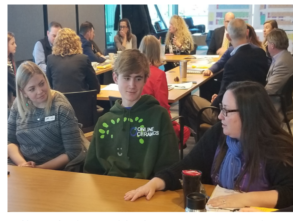
Above: Student participation was paramount to the success of the Innovation Summit.

This event was a first-of-its-kind for Peak to Peak and based on the feedback we have received, it was incredibly successful. One of the greatest take-aways was to embrace failure as a learning opportunity, rather than avoiding it or trying to prevent it. Along with this is the importance of creating an environment in which it is safe to take risks. The group encouraged