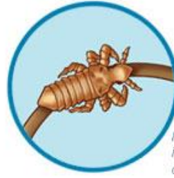
Magnified illustration of a louse.

Nits are the silver-white lice eggs that attach to the hair.