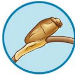
Magnified illustration of an egg.

Head lice cannot jump or fly. They do not infest other animals such as the family dog or cat.