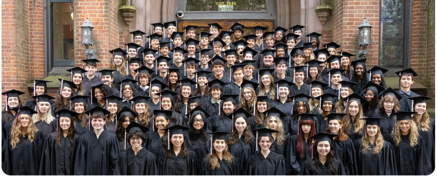
Packer's Class of 2024